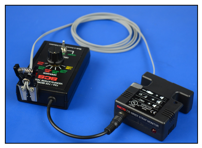
Figure 4. Using the Verification Tester with the 725 Portable Wrist Strap Monitor