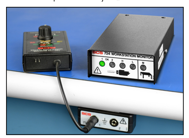
Figure 3. Using the Verification Tester with the 724 Workstation Monitor

1. Insert the Verification Tester's stereo plug into the monitor's operator remote jack #1.