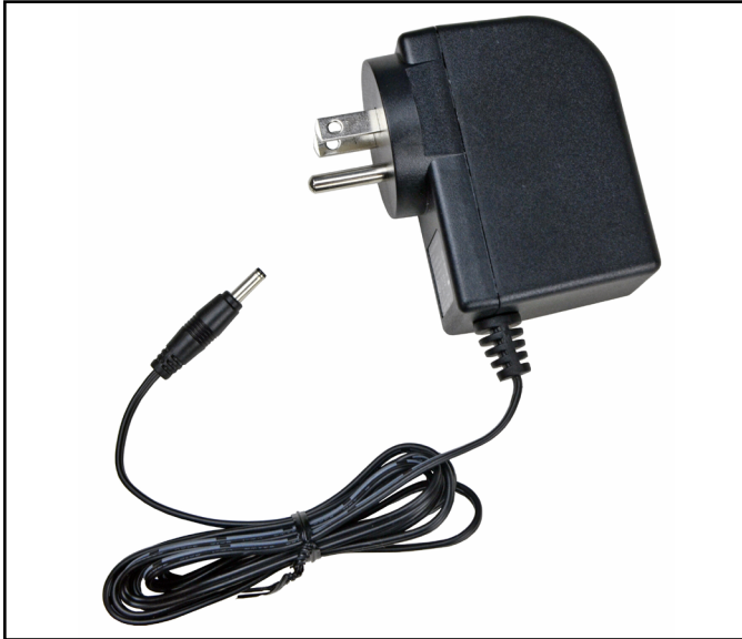
Figure 2. North American power adapter included with the 19239 and 19242 Mini Monitors