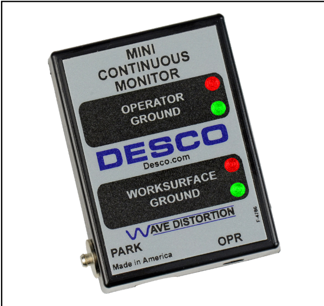
Figure 1. Desco Mini Monitor