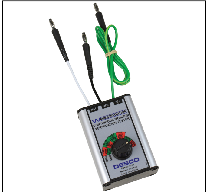
Figure 9. Desco 98221 Wave Distortion Monitor Verification Tester