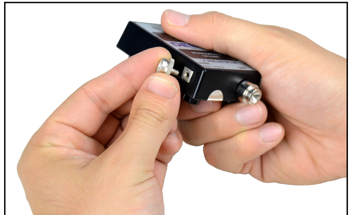
Figure 7. Changing the park snap on the 19243 Mini Monitor

The 19243 Mini Monitor includes an interchangeable 10mm park snap and 10mm banana jack adapter for operators who use wrist cords with 10mm terminations. Use the park snaps' knurled rims to unscrew the 4mm park snap from the monitor and install the 10mm park snap to the monitor. Plug the 10mm operator jack adapter into the monitor's operator jack.