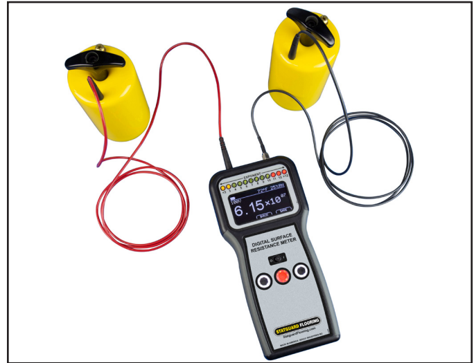
Figure 2. D19290 Statguard Flooring Surface Resistance Meter Kit

Test the surface resistance point to point (R tt or R tg ), and resistance-to-ground (R tg or R g ) properties of coated area per ANSI/ESD S7.1 or Compliance Verification ESD TR53 at initial installation and quarterly. For quick and easy verification of the coating, we recommend using a Desco Industries Surface Resistance Test Meter Kit.