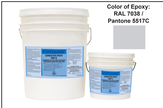
Figure 1. Statguard® Conductive Epoxy, Parts A and B