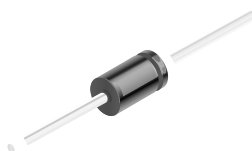
DO-35 Glass case COLOR BAND DENOTES CATHODE