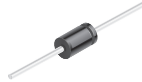
AXIAL LEAD (DO-35) CASE 017AG (Color Band Denotes Cathode)

ABSOLUTE MAXIMUM RATINGS ( T_A = 25^\circ\text{C} unless otherwise noted) (Notes 1, 2, 3)