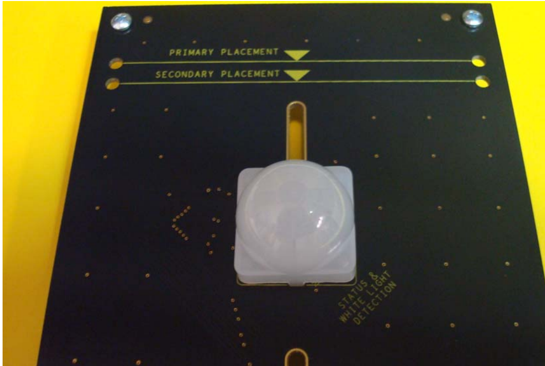
Figure 2. Assembled Clip-In Lens Installed on the ZMOTION 20-Pin Detection and Control Development Board