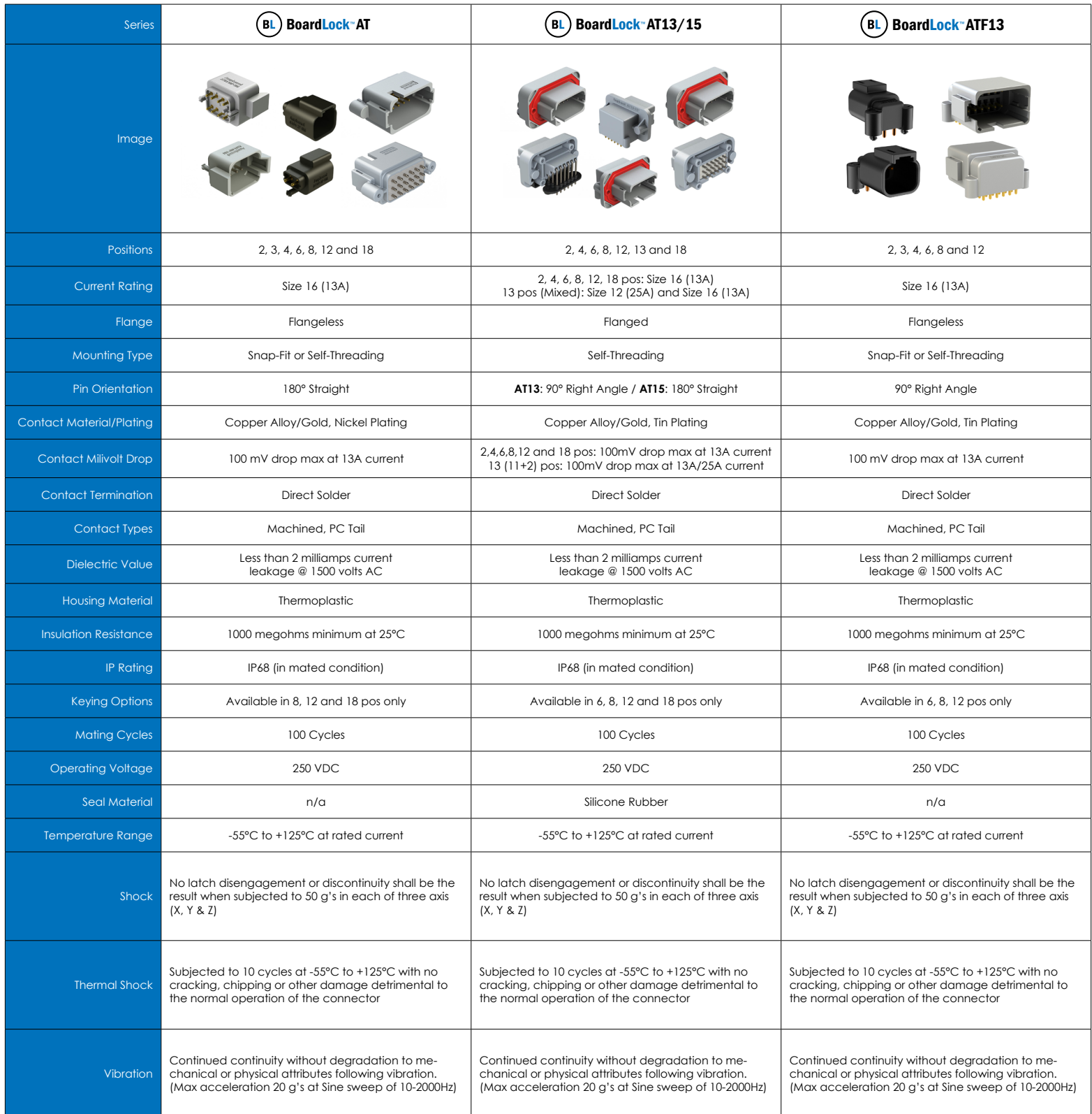
BoardLock™ Family Comparison Chart (See individual datasheets on www.amphenol-sine.com for full specs, faceviews, keying location and product dimensions.)